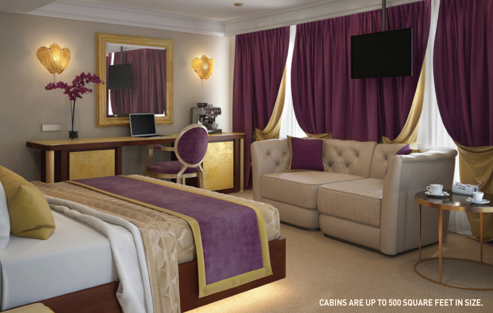
CABINS ARE UP TO 500 SQUARE FEET IN SIZE.