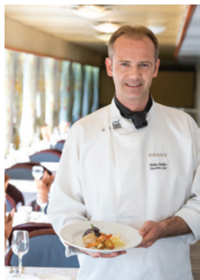
Stellar service, forging new friendships aboard and top rate, expert-lead excursions are trademarks of World Quest Cruises.